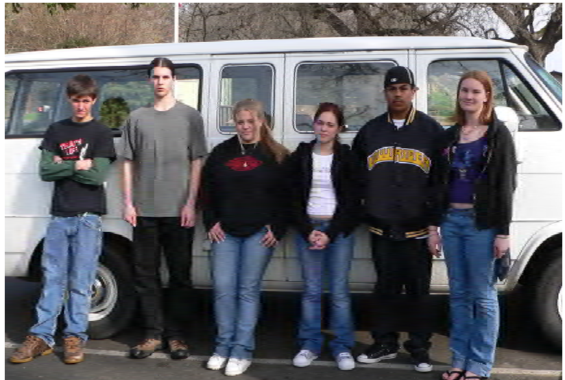
Teens and 'tweens need adults who are positive role models.

By the middle and late teen years, growth is still occurring rapidly, acne may be a problem, and children are trying to reconcile who they are on the inside with who they appear to be on the outside. Some teens experience emotional ups and downs while others struggle with awkward physicality, both side effects of a quick-growing body.