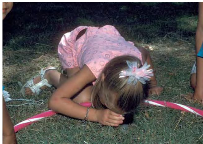
An interpreter helps tiny people enjoy activities on the big stage.

Kids in this stage of development do not typically have the ability to perform logical