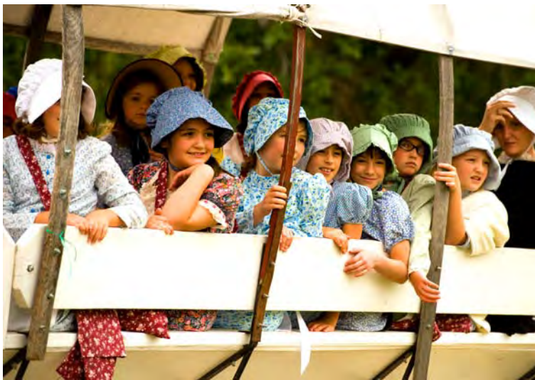
School group programs require careful planning.

All programs conducted for school groups within California State Parks must be aligned with academic content standards. These content standards direct what each student must learn in each grade within California schools. Since a school's accountability is based on the academic content standards, creating interpretive opportunities that incorporate these content standards increases the overall benefit for the students, schools, teachers, and the park. Programs should get students into natural and cultural settings, provide opportunities for them to learn about and experience science and history firsthand, expose them to California State Parks, and help teachers meet content standards. By meeting teachers' needs, we are assured continued support from schools as we reach out to this important audience.