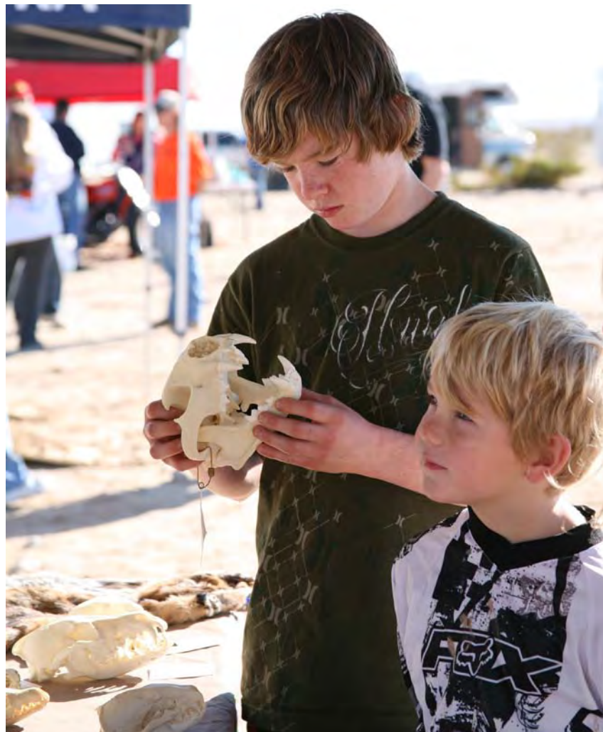
Our childhood experiences affect us forever.

Introducing nature and history to kids through our interpretive efforts may be their first authentic exposure and, as such, can have a life-altering effect on them. Many of us as children were so moved by natural and/or cultural experiences that we chose interpretation as our careers. Our childhood experiences affect us forever. That is why, as an interpreter, you should always proceed as if each program you create and deliver may change lives. You may never know the impact you and your program have on a child. Therefore, it is with respect that we provide programs specifically for children.