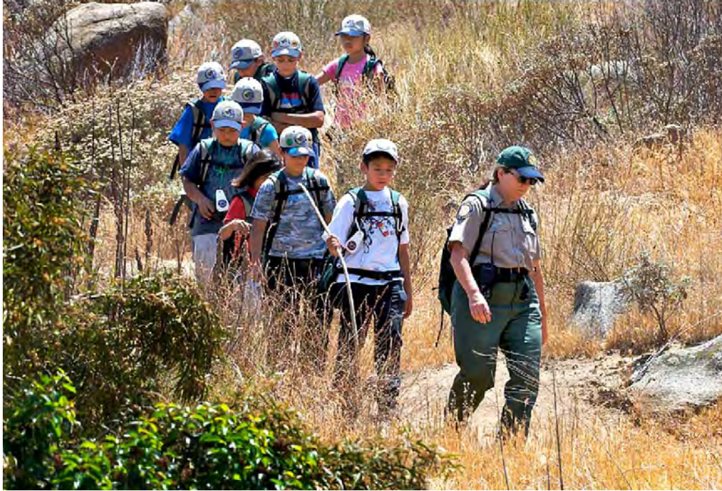
Children's programs encourage exploration and direct interaction with nature.