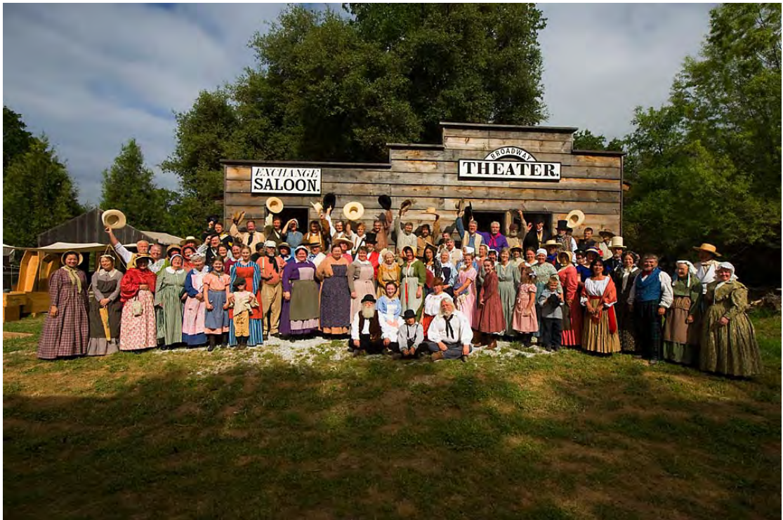
When California State Parks become partners with schools, everybody wins.

Now that you understand the general types of kids' programs we offer, let's review the basic characteristics of children relevant to conducting successful interpretive programs.